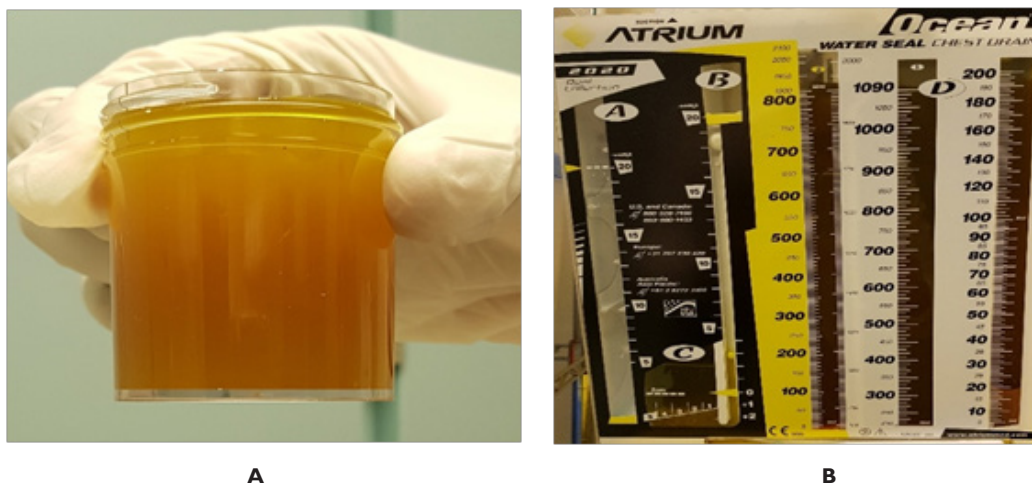
Figure 5 A,B: Fluid drained by ICT.