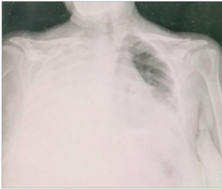
Figure 2 CXR with massive pleural effusion.

Urgent thoracic surgery consultation was done for intercostal tube (ICT) insertion, but strangely thoracic surgeon postponed the procedure for the next day waiting for computerized tomography (CT) of the abdomen and chest with contrast requested by oncologist to ensure about leakage from PTBD and commented on low thoracocentesis done by pulmonologist in eight spaces (he may have thought about iatrogenic biliary injury by pulmonologist!). CT chest and abdomen came later and reported by radiologist against any leakage (Figure 4).