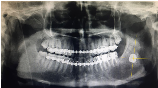
Figure 4 PRF Placement.