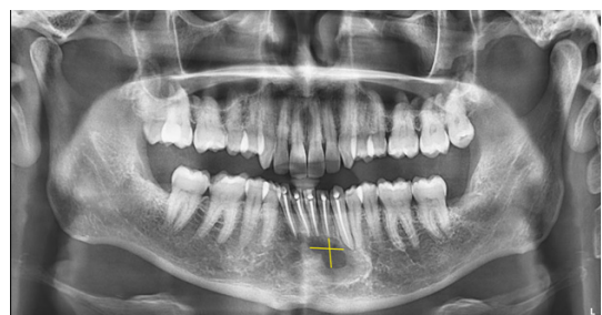
Figure 2 6 th month postoperative OPG.