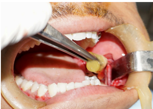
Figure 3 Preop OPG.

An 18-year-old adolescent boy was reported to the Division of Oral and Maxillofacial Surgery with a chief complaint of swelling over the lower left side of his face. Aspiration biopsy established a histopathologic diagnosis of a benign cystic lesion. An OPG (Figure 3) was done revealing well-defined uni-locular radiolucency extending from the mandibular body to the sigmoid notch. 38 was found to be impacted and circumferentially enveloped by the cystic lesion. A two-stage treatment plan was formulated with decompression of the cystic lesion carried out in the first stage followed by enucleation and peripheral osteotomy with PRF placement in the second stage. A-PRF was harvested from the patient with the set parameters: 1500 rpm, 208 g centrifugation force, and 14 min centrifugation time (Figure 4). The extracted A-PRF was packed into the cystic cavity and closure was completed. Postoperative healing was uneventful with no neurosensory deficit. The patient maintained follow-up for a 6-month period (Figure 5).