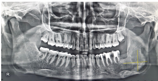
Figure 5 6 th month postoperative OPG.